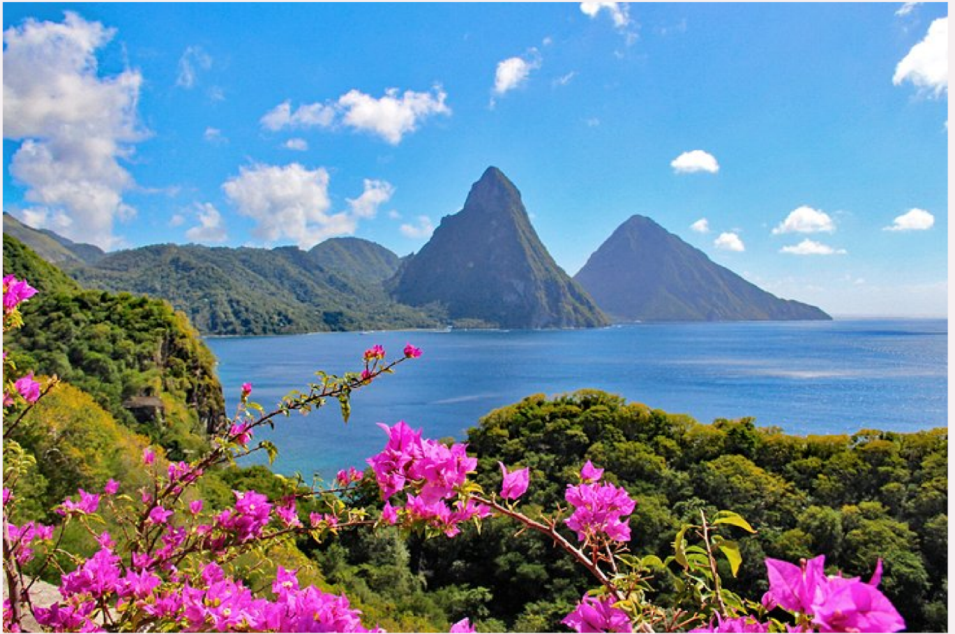
View of the Pitons from Jade Mountain Resort

This newsletter is a product of the Department of Sustainable Development Ministry of Education, Sustainable Development, Science, Technology and Vocational Training Georgiana Court John Compton Highway Saint Lucia Telephone Number: +1 758-468-5863 Email Address: sdestlucia@gmail.com